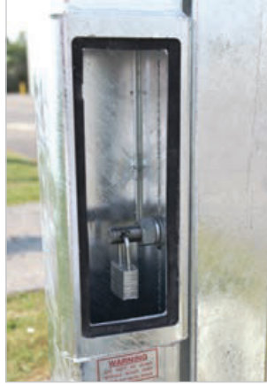
Tilt-down columns have the facility to be padlocked internally