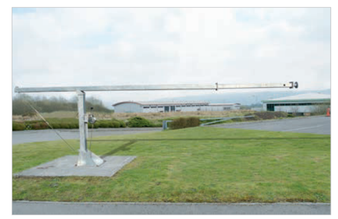
ACC2BPLA in tilted position