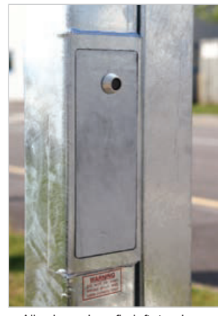
All columns have flush fitting doors